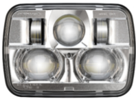
Part Number 0554431 12-24V ECE LED LHT High & Low Beam Headlight with Chrome Inner Bezel - Single Light