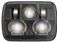
Part Number 0554451 12-24V ECE LED LHT High & Low Beam Headlight with Black Inner Bezel - Single Light