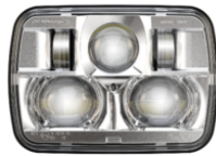
Part Number 0554471 12-24V DOT/ECE LED RHT High & Low Beam Headlight with Chrome Inner Bezel - Single Light