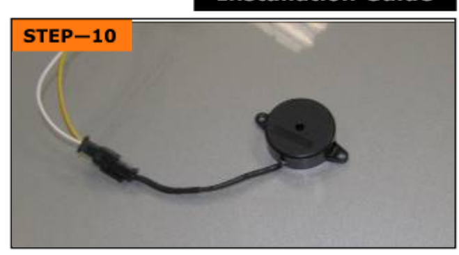
Connect the buzzer. Using the double sided tape, place buzzer in the trunk, in a hidden position. Position the buzzer so it can be heard well from the driver seat.