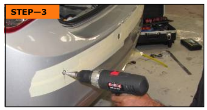
Using masking tape, measure the rear bumper for even positioning of the sensor heads. Once accurate, drill holes for the sensor heads.