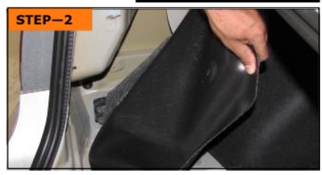
Using plastic tool, remove left side interior panel to reveal reverse light connection.