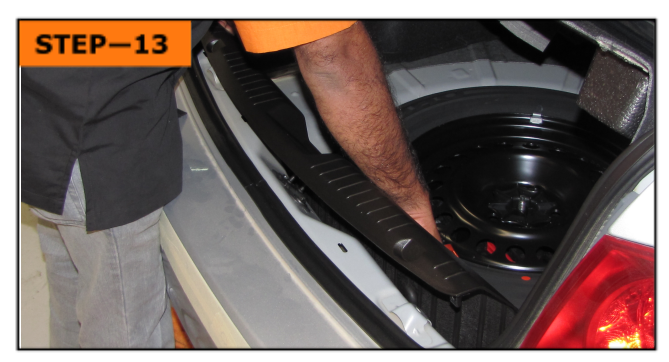
Test all functions. Replace all trims and panels.