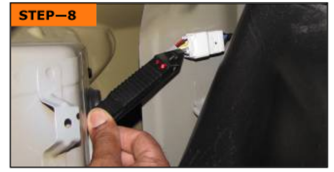
Check for reverse light power and ground.