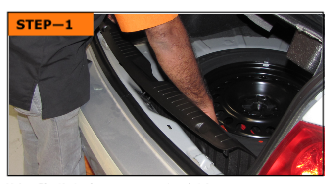
Using Plastic tool, remove rear trunk trim.