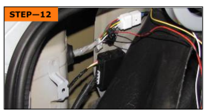
Use double sided tape provided to secure the module, and secure all wires with cable ties..