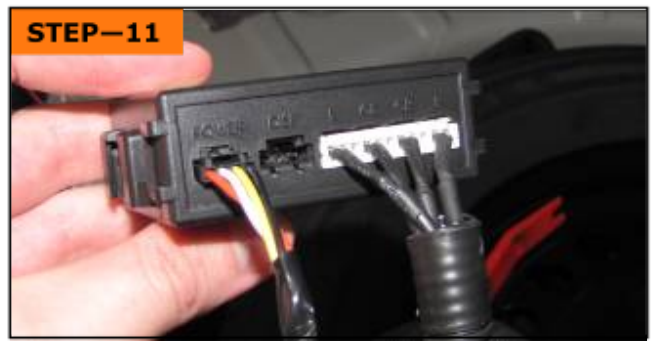
Connect all looms and wires to the control Module.